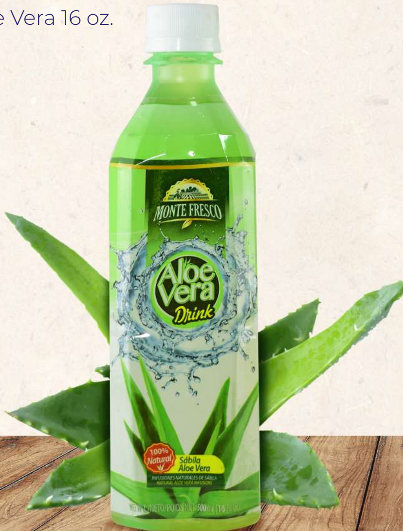
Aloe Vera 16 oz.